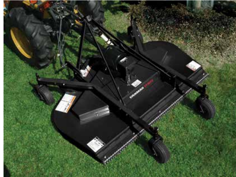
YFM54 shown with optional chain shielding*

*All YFM Series finish mower models pass all applicable safety standards for thrown object and blade contact without chain shielding. However, if these units will be used in areas where the possibility of thrown objects could be hazardous to persons or property, it is strongly recommended that optional chain shielding be used for extra protection.